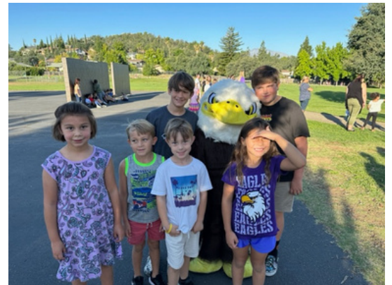
FRIDAY EAGLE MILE